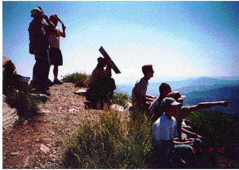
On Target book at Scout Shop